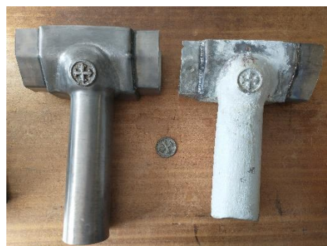
New and old lead junction sections

The total cost of these three 'water-related' items was around £41,000 which after deduction of grants of £19,000 has completely exhausted our Fabric Fund and necessitated payments from the General Fund.