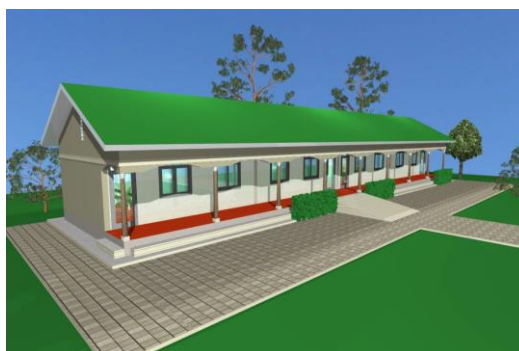
Proposed new Classroom Block