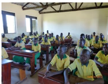
St Stephen's School, Terekeka