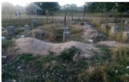
Progress on Foundations for new block