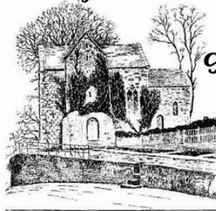
ST. MARTIN'S, WAREHAM.

retiring collection in aid of the church fabric fund