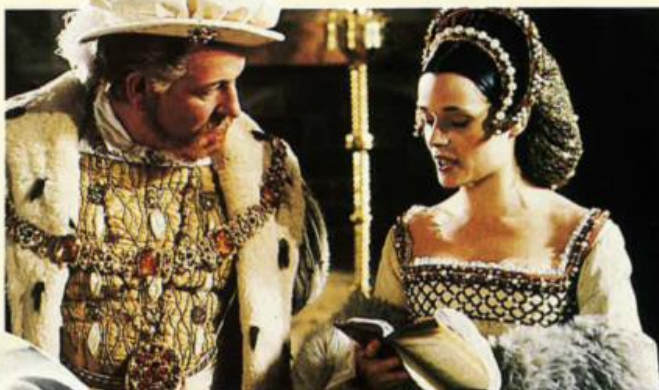
King Henry VIII ordered Tyndale's arrest. But after Tyndale's execution, Henry had the martyr's work circulated throughout his realm.

GATEWAY FILMS CHURCH HISTORY SERIES bring you the stories of the heroes of the Christian faith over the centuries. Ask your dealer for a complete catalog.