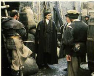
Tyndale, played by noted actor, Roger Rees ( Nicholas Nickleby ), confers with dock workers who smuggle his Bible translations into England.

Imagine it! A time in England when it was against the law to have the Bible in English, when even saying The Lord's Prayer in English was prohibited.