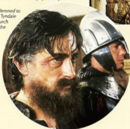
Tried and condemned to death in 1536, Tyndale challenged church doctrine with the scriptures as his authority.

A TRUE STORY , God's Outlaw is about international politics, church intrigue, cold-blooded betrayal, and false justice ending in a criminal's death. But it's also about victorious faith and spiritual triumph over some of the greatest political and religious forces in the 16th century.