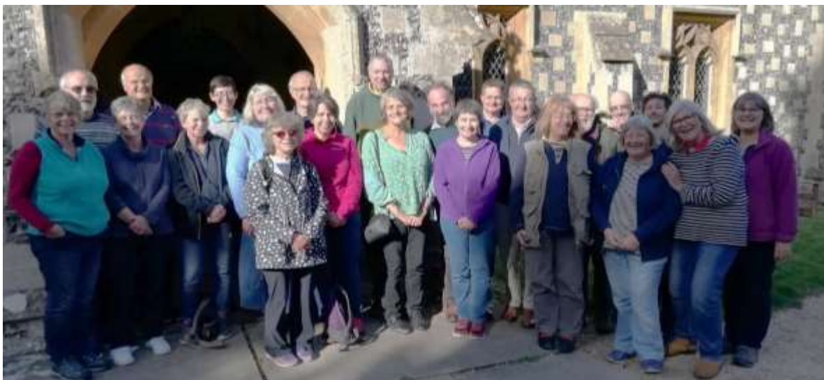
Wareham bell ringers and friends on our ringing tour to Devizes - 2022

Finally, if you would like to know more - you may like to see the bells or even learn to ring, then please do get in touch.