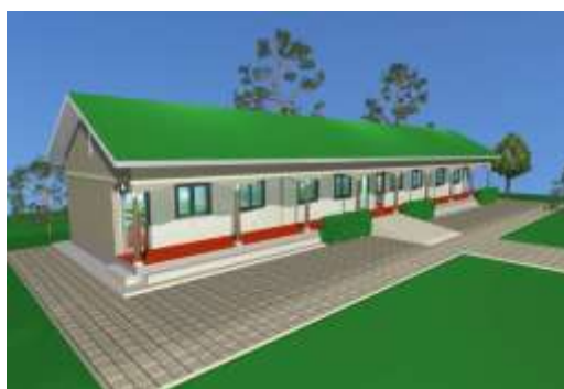
Proposed new Classroom Block