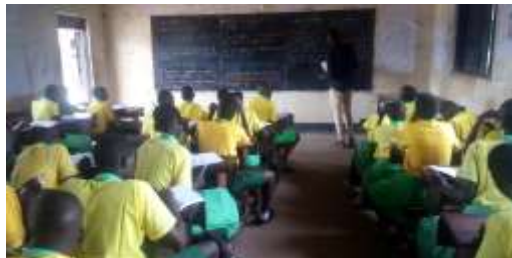
Senior School Class at St Stephen's